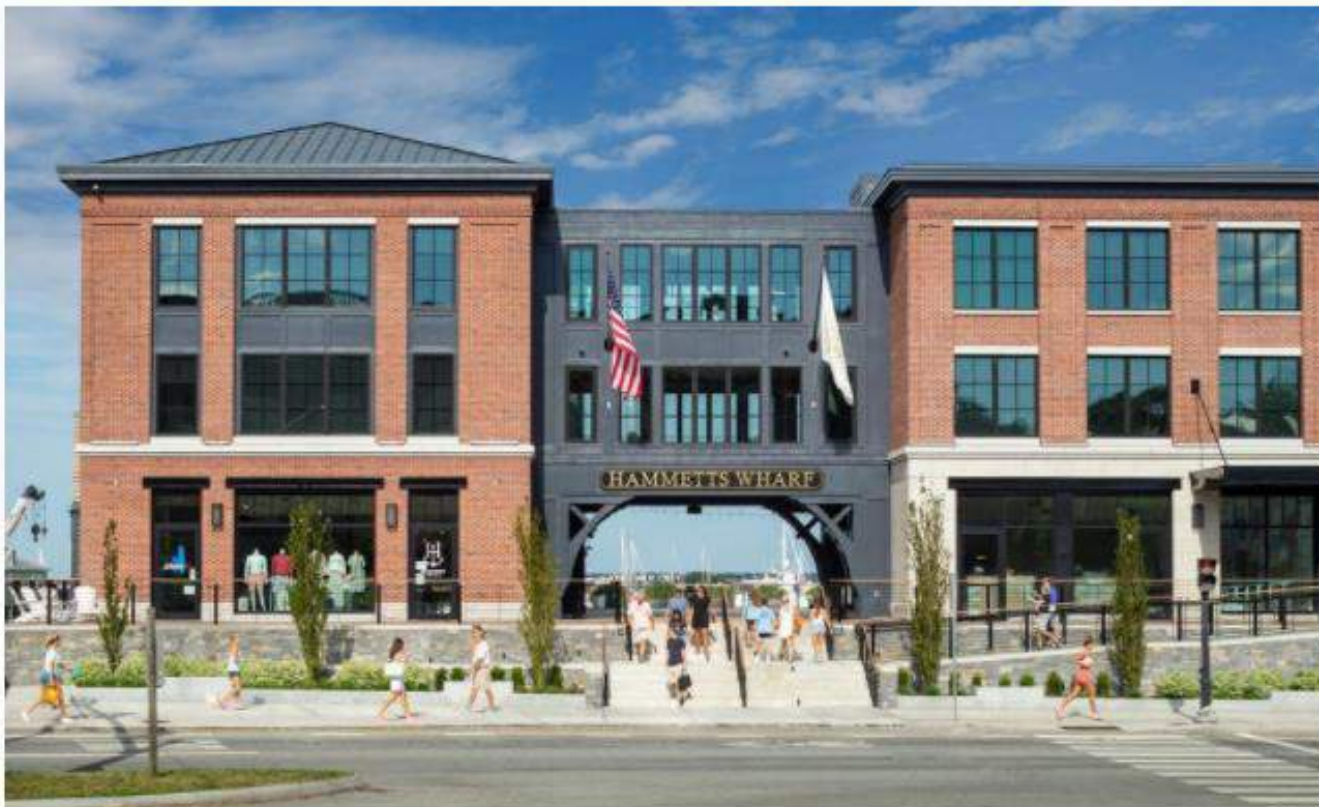
The property opened in June of 2020.

Located in the heart of downtown Newport, Rhode Island, Hammetts Hotel opened in the summer of 2020 at a time many hotels were struggling amid the Covid-19 pandemic. The silver lining of opening a property during such a time? “As a new hotel, we are implementing the