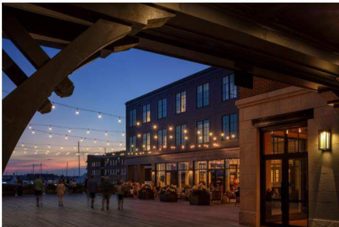
The hotel's 9,000-square-foot deck overlooks Newport Marina.

With Covid protocols firmly in place—from rigorous cleaning and sanitization to contactless approaches where it makes sense while still providing hospitality—the hotel has successfully opened its doors and embraced city, state, and national standards when it comes to health and safety.