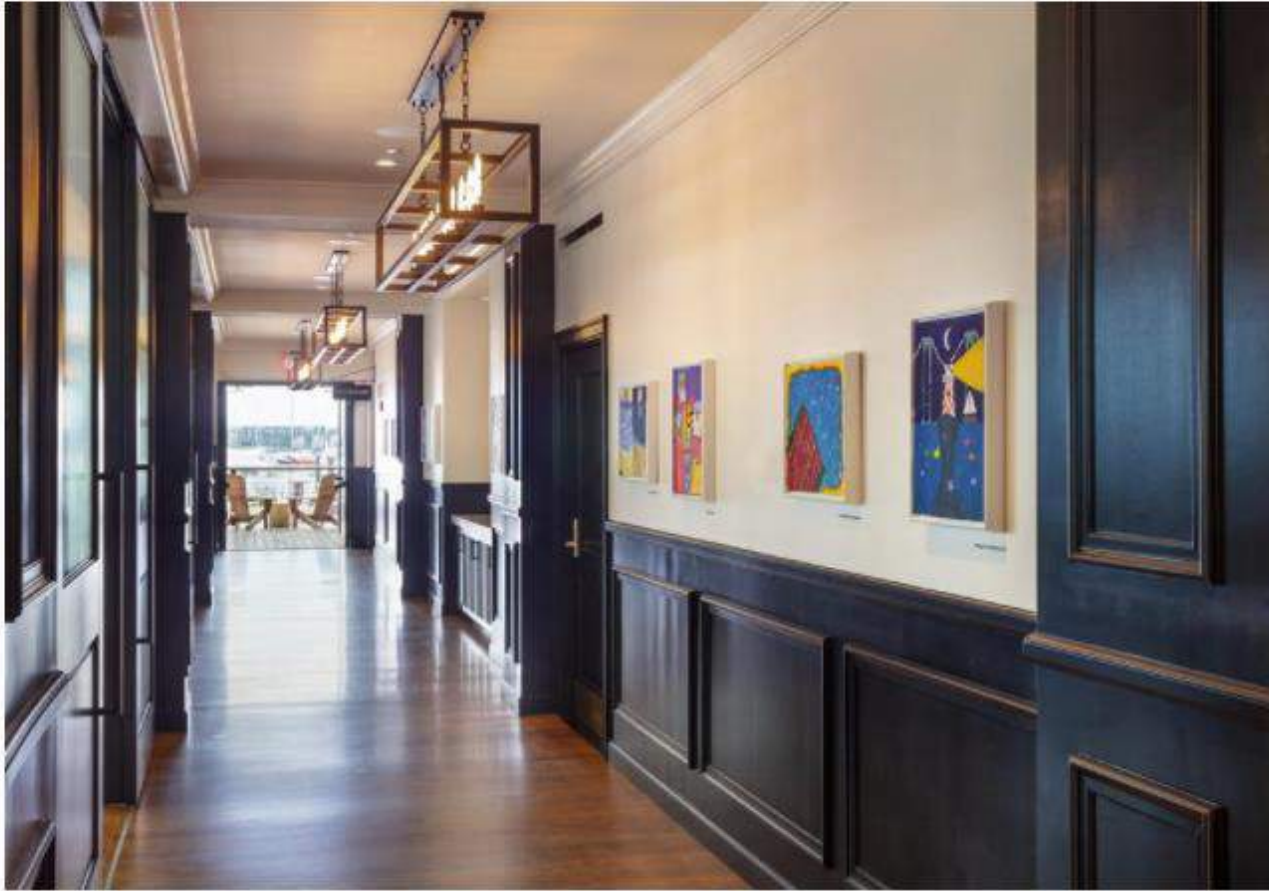
The active art gallery changes seasonally.