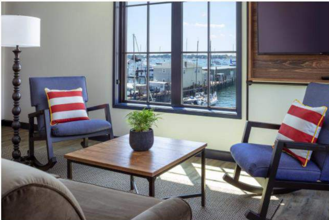
The guest rooms have views of the water.