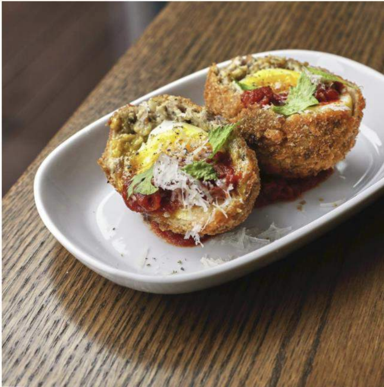
The Scotch meatball is a fan favorite.